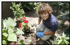
AB School West Students Engage, Learn through Garden Program pg. 4