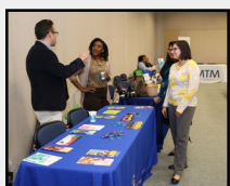
Community Health and Resources Forum held at HCDE May 4-5 pg. 5