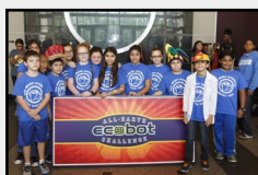
All-Earth Ecobot Challenge Attracts 1,500 Area Students for Innovative Robotics Competition pg. 5