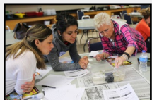
Teaching and Learning Center Workshop Provides Teachers with Aquatic, Terrarium Habitats pg. 2